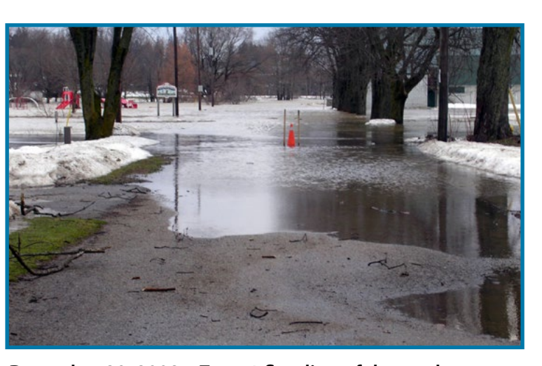
December 29, 2008 – Zone 1 flooding of the road leading to the fairgrounds.