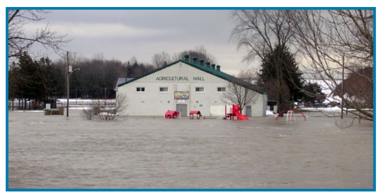
December 29, 2008 – Zone 2 flooding at the fairgrounds.