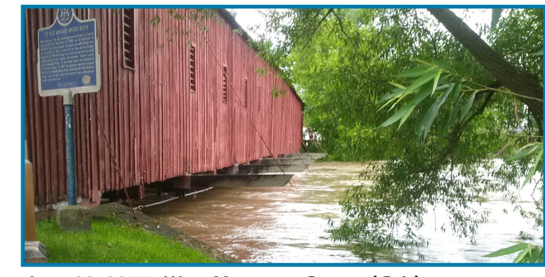
June 23, 2017 - West Montrose Covered Bridge.