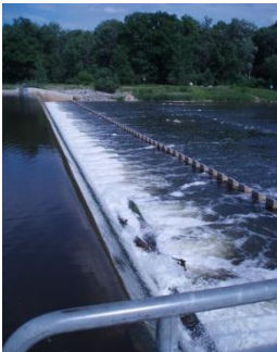
Mannheim intake, Grand River

The Region's approach was documented in the 2000 Water Supply Master Plan (WSMP), which was updated in 2007 and is currently being reviewed again in 2012. The Plan includes measures such as water reduction targets under the Water Efficiency Master Plan, continuation of once-a-week lawn watering restrictions, and phased-in capital investment for increasing water supplies.