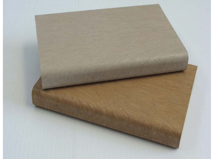
Making the New from the Old - recycling helps create the solid plastic lumber called Baleboard®.