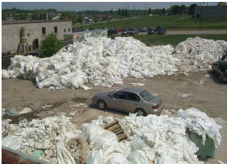
One of Many Important Supporters – working with the Ontario Federation of Agriculture to develop the collection program, where piles of plastic are recycled into new products at the company's New Hamburg plant.