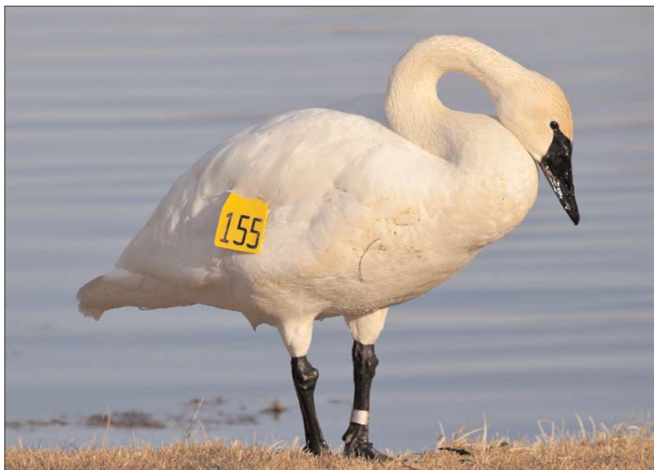
Two tagged Trumpeter swans, such as this one, were shot at Luther Marsh.

The young will stay with their parents until September before migrating south. The URL is www.birdsofbreslau.com .