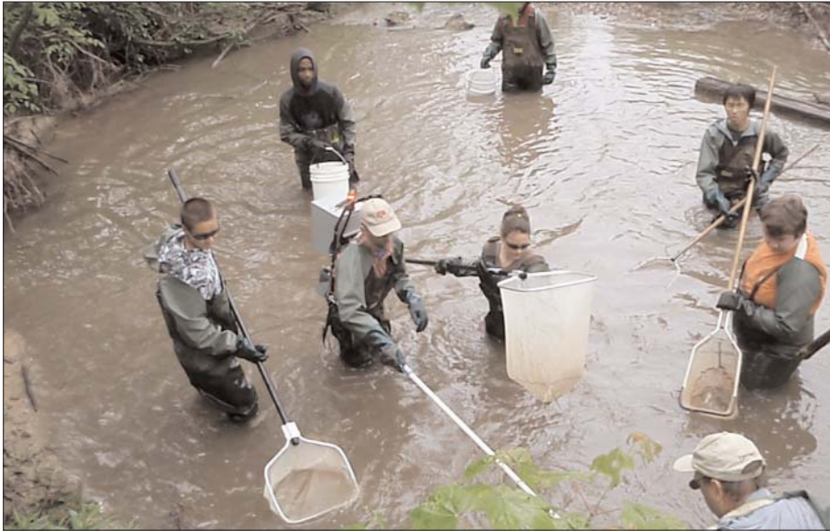
Students from Pauline Johnson Collegiate have an in-class fish hatchery and undertake numerous activities to improve the fishery.

mass study of Whitemans Creek (the last study was in 1998). The results of this should show the health of the brown trout fishery in Whitemans Creek and provide the future direction for the BRGC hatchery.