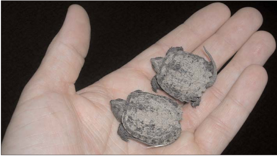
Baby snapping turtles are tasty treats to many predators, such as raccoons and skunks. While these are natural predators, their numbers have grown due to human activity. These two are likely hatchlings of the turtle featured on the cover.