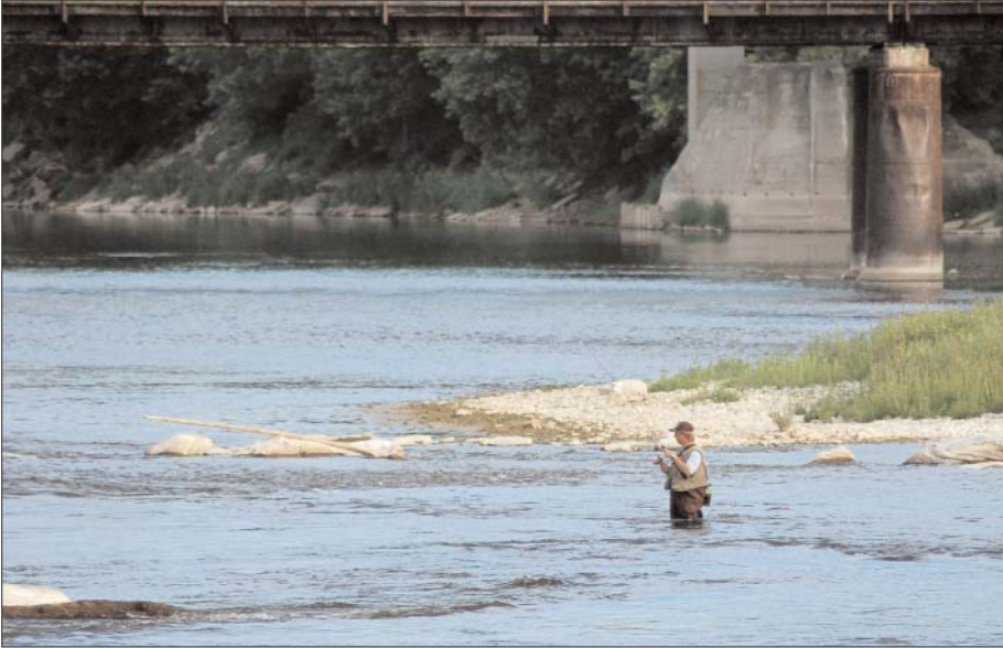
The Grand River in Brantford is known as the Exceptional Waters and the fishing is good thanks to habitat improvement, education, partnerships, water quality improvements and fish stocking.

the students at sites where brown trout stocking programs exist (Conestogo River and the Grand River tailwater). The number of fish is small because there are challenges associated with students rearing the eggs. The students usually end up with fewer than 100 two to three cm long fish to be released into the river on a field day.