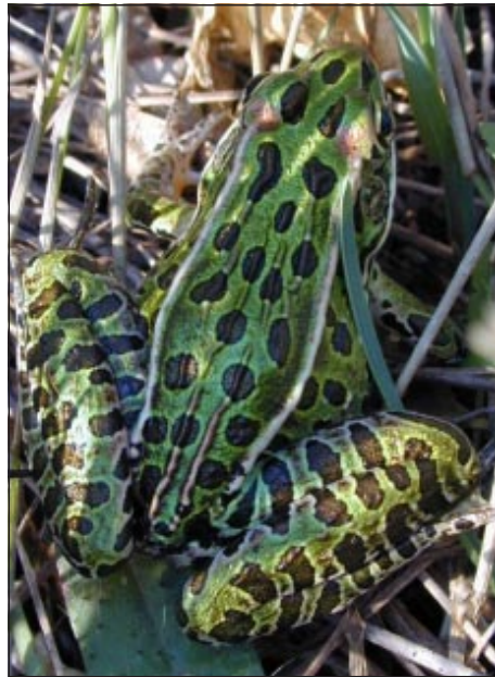
Small vertebrates, like this Northern Leopard Frog, make up the bulk of the diet for most snake species in Ontario.

The four most critically troubled species of snakes in the Grand River watershed each have a unique reason