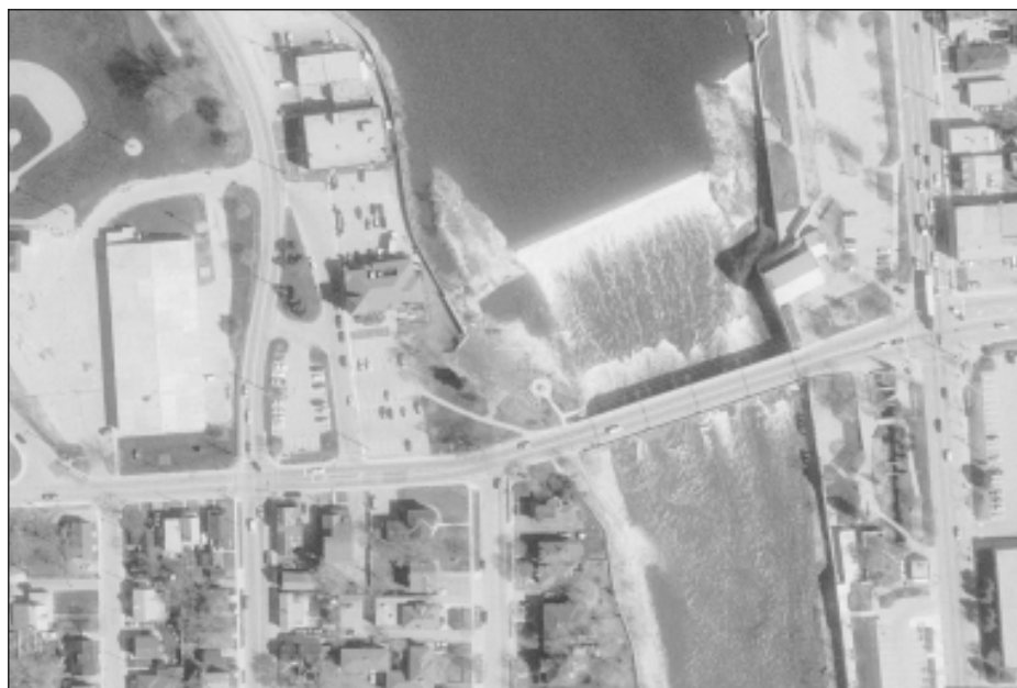
This aerial photograph shows the Grand River at Parkhill Dam in Cambridge.

Aerial photography and large scale mapping are used at the GRCA for determining the extent of natural hazards, wetlands, and floodplains. They provide key resource information to GRCA's planners and engineers when reviewing development proposals and municipal planning documents and are used for many other applications. Partnerships between the GRCA and member municipalities have provided newer aerial photographs and large-scale topographic mapping in selected areas such as Brantford, where in 1995 mapping was carried out through an