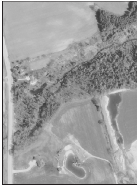
This aerial photograph shows a small stream with a protective buffer of trees and shrubs. This buffer reduces the risk of pollutants entering the waterway with runoff from the adjacent land.

In 1999, the GRCA hosted additional information sessions to report pilot results and discuss starting a shared-cost, multi-partner project. With overwhelming support, the GRCA proceeded and released a detailed Request for Proposal (RFP) in the spring of 2000. In order to make this tool more cost-effective and available on a wider basis than the Grand River watershed, the Upper