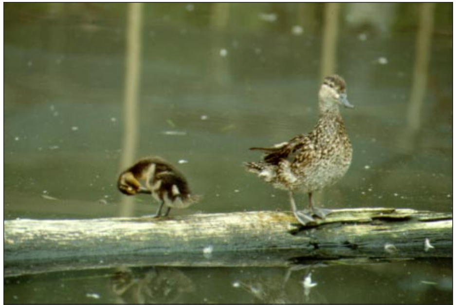
Luther Marsh is a significant breeding and feeding area for ducks like this Green-winged Teal hen and her offspring.

Luther Marsh is jointly managed by the GRCA and the Ministry of Natural Resources. The partnership with the Important Bird Areas Program implemented by the Federation of Ontario Naturalists is considered to be another step in the recognition of the