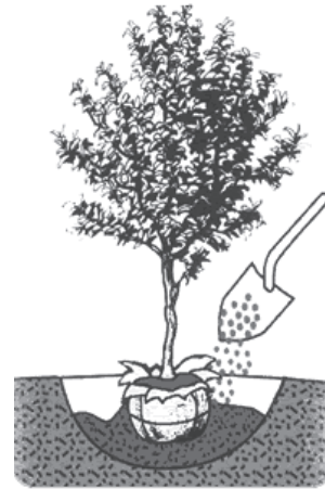
Pull burlap & basket away from stem