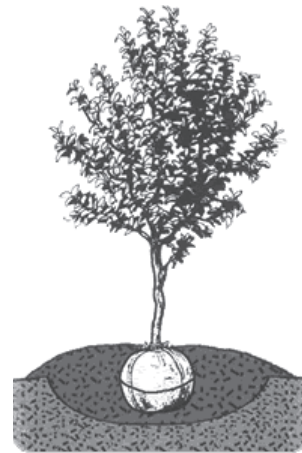
Raised beds for hard soils (clay)