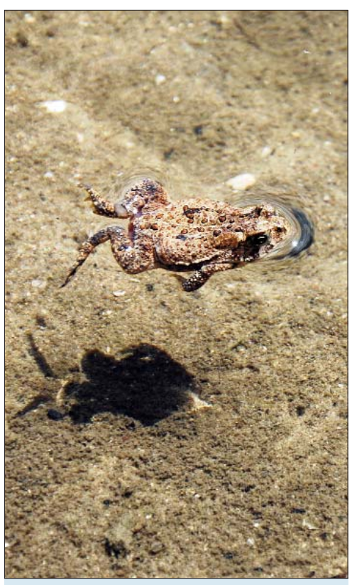
Species such as the American toad are common and widespread in our watershed.

More than 300 native birds have been observed in the watershed, but there are only 43 native reptiles and amphibians, so it's easier to complete a herp list than a bird list. The word herpetofauna comes from the Greek word herpetos, which means crawling.