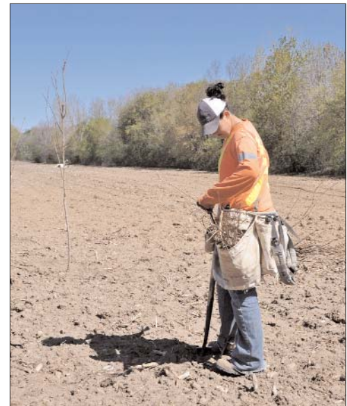
The GRCA arranges to have planting done on private land.

For more information, to order trees and to view the tree availability list, visit the forestry section of the GRCA website at www.grandriver.ca/Trees.