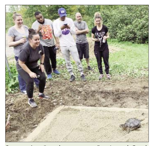
Snappy is a "teacher creature" at Laurel Creek Nature Centre and she tested out the new site as it was being completed.

Helping turtles doesn't end with the nesting grounds. Once the eggs are laid, they need to be protected for better hatching success. Unlike birds, adult turtles don't tend their nests after the eggs are laid, nor do they care for their young once they hatch.