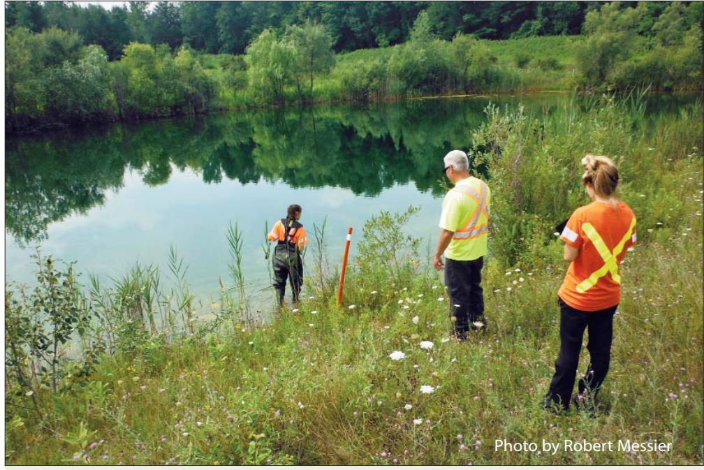
Mill Creek Rangers visit a rehabilitated gravel pit to see how nature can be brought back to quarries.

The GRCA has given out Honour Roll awards since 1976 and Watershed Awards since 1983. You can learn more on www.grandriver.ca/awards.