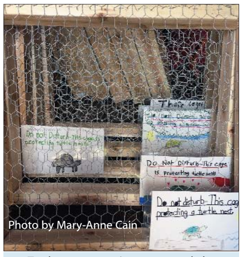
Turtle nest cover signs were made by students.

Over 280 native wildflower and grass plugs were also planted to enhance the surrounding habitats. Native plants provide barrier-free travel for female egg-laying turtles and they protect hatchlings when they emerge in the fall.