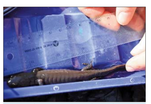
A researcher measuring a salamander. Monitoring is an important step in finding solutions.

Some municipalities have also implemented solutions such as reducing speed limits, posting turtle crossing signs, temporary road closures, as well as public education. For example, in recent years, the spring migration of Jefferson salamanders has sparked a temporary closure of Stauffer Drive in Kitchener. In this case, the closure was required by the MNRF, which oversees the endangered species legislation. Jefferson salamanders are one of many species that are protected under Ontario's Endangered Species Act, because their population is in decline.