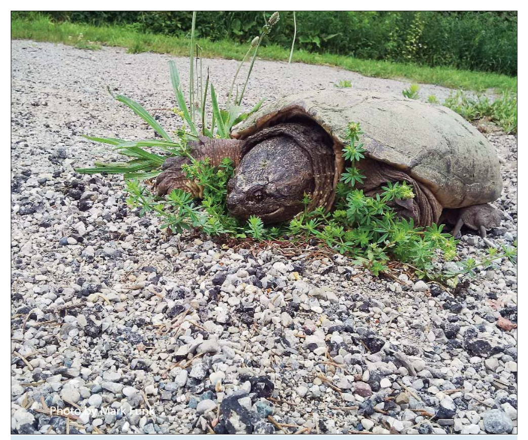
Snapping turtles lay their eggs in gravel, which is often found by the side of the road. There are many ways to help them stay safe from traffic.