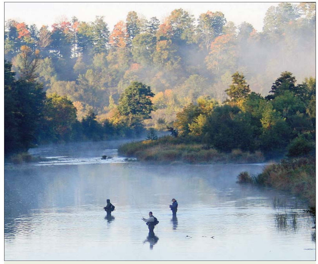
Anglers provided a lot of input into the fish plan.