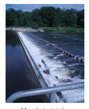
Mannheim intake, Grand River

The Region's approach was documented in the 2000 Water Supply Master Plan (WSMP), which was updated in 2007 and is currently being reviewed again in 2012. The Plan includes measures such as water reduction targets under the Water Efficiency Master Plan, continuation of once-a-week lawn watering restrictions, and phased-in capital investment for increasing water supplies.